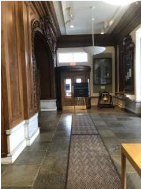
County Sheriff's Building, 70 Ethan Allen Drive, South Burlington, VT Fiscal year, February 1, 2019 to January 31, 2020.